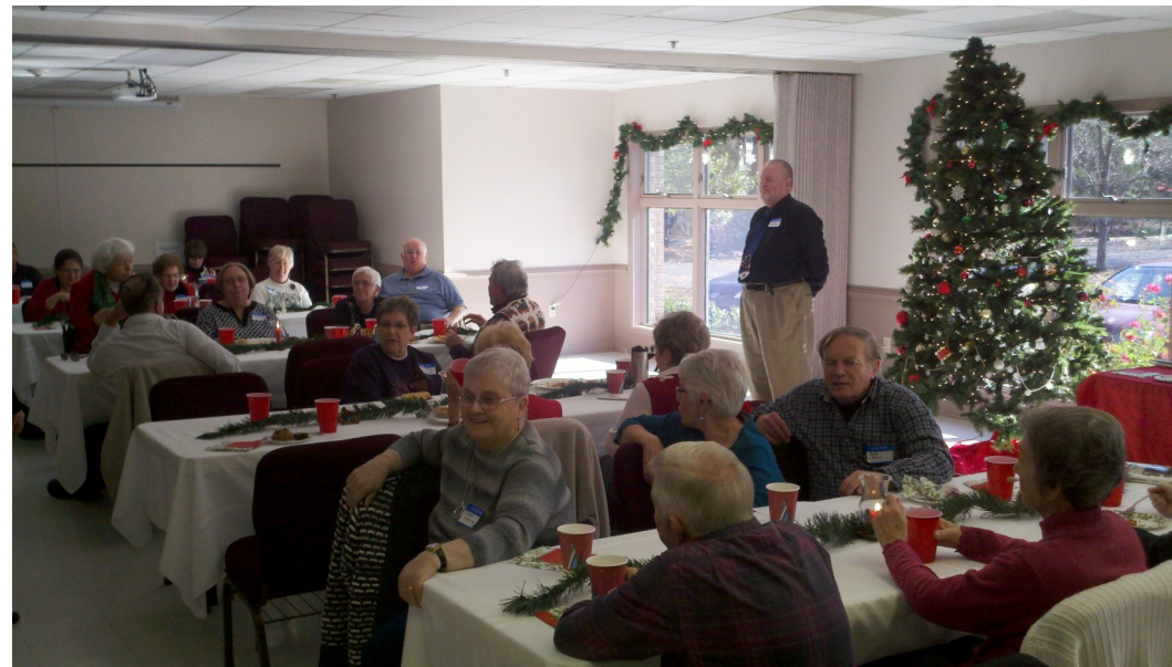
Kirkwood Silver Christmas Luncheon., December 2012

The first evidence of running water can be traced as far back as 1500 BC on the island of Crete where it was used in one of the earliest “flushing toilets.” But running water has widely been credited to the ancient Romans whose vast network of aqueducts brought water from as far away as 50 miles. Obviously, humanity has come a long way in providing running water to many households making for much improved sanitary conditions. However, the problem with running water is that we let it run. It’s bad enough that we have to let it run to warm up but we also let it run while we shower, shave, brush our teeth, wash dishes, and do the many other tasks for which we use water. Understanding that, there are many ways to conserve water by not letting it run. Take a bath, fill up the sink to shave, and rinse the dishes all at once are some of the ways to use less water. The bottom line is to run the water only when we are actually using it. It is astounding how much less water a community uses just by following a few of these simple ideas.